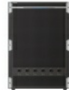
XVS-9000 Flagship 4K/3G/HD multi-format IP-ready video switcher