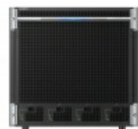
XVS-8000 High-end 4K/3G/HD video switcher for IP and SDI