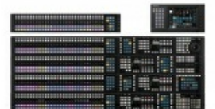
ICP-X7000 Control panel for XVS Series and MVS-X Series switchers