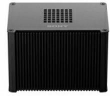
Edge Analytics Appliance

Handwriting Extraction PTZ Auto Tracking Chroma-key-less CG Overlay