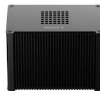
Edge Analytics Appliance

Handwriting Extraction PTZ Auto Tracking Chromakey-less CG Overlay