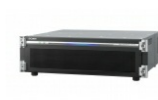
NXL-FR316 SDI-IP signal processing unit