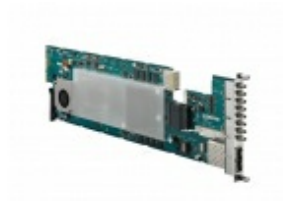
NXLK-IP50Y SDI-IP Converter Board with eight 1.5/3G-SDI ports, supporting SMPTE ST 2110 in HD/4K and HDR