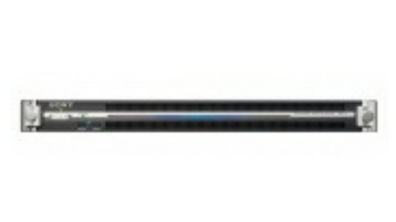
PWS-110NM1 IP Live System Manager workstation