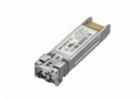
OTM-25GLR SFP28 Optical Transceiver Module (LR)