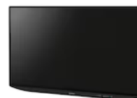
LMD-XH550MT 55-inch 4K 3D/2D LCD medical monitor