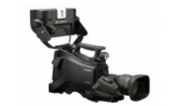
HXC-FB80 Three 2/3-inch Exmor™ CMOS sensor HD colour studio camera