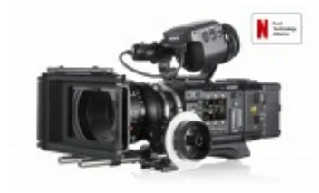
PMW-F55 Super 35mm 4K CMOS sensor compact CineAlta camera records HD/2K/4K on SxS memory plus 16-bit RAW 2K/4K output