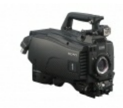
HDC-4300 4K/HD System Camera