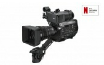
PXW-FS7M2 4K Super 35mm Exmor CMOS sensor XDCAM camera with Variable ND Filter, E-Mount (Lever Lock), 4K/2K RAW and XAVC recording