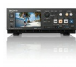
PMW-PZ1 4K/HD SxS memory player