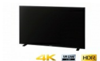
PVM-X550 55-inch 4K TRIMASTER EL™ OLED high grade picture monitor