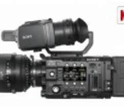
PMW-F5 Super 35mm 4K CMOS sensor compact CineAlta camera records HD/2K on SxS memory plus 16-bit RAW 2K/4K output