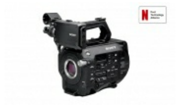
PXW-FS7 4K Super 35mm Exmor CMOS sensor XDCAM camera with α Mount lens system, 4K/2K RAW and XAVC recording options