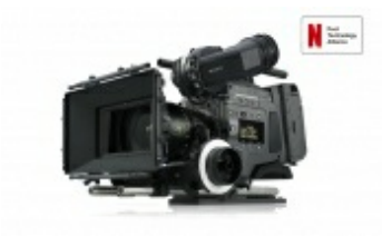
F65 Super 35mm 8K CMOS sensor SRMASTER camera