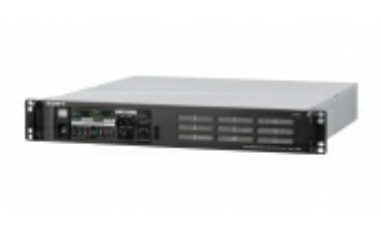
HDRC-4000 HDR Production Converter Unit