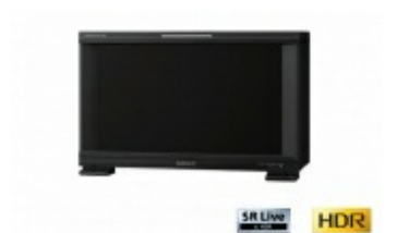
BVM-E171 16.5-inch TRIMASTER EL™ OLED critical reference monitor with wide viewing angle supports 4K production