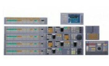
MVS-8000X 4K, HD, 3G, SD Multi-Format Production Switcher Processor