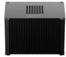
Edge Analytics Appliance

Handwriting Extraction PTZ Auto Tracking Chromakey-less CG Overlay