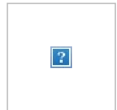
HDCU-5000 Camera Control Unit (CCU) for HDC-5500 and HDC-3500/3100 series system cameras